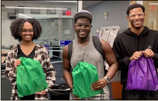
Scholars pictured with their "swag bags"